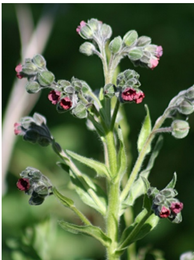
NRCS, Cynoglossum, Houndstongue, Columbus, MT 5/24/2007

Houndstongue has Velcro like seeds, sometimes called burrs, which attach to nearly everything they touch, even tires. By sticking to other objects the seed is transported to other areas, starting new infestations. Many people use rangelands, recreational areas, and private lands for work and enjoyment. All of the people who use these lands have the potential to spread Houndstongue and other noxious weeds. In this lesson students will form a web around weeds showing how many activities have the potential to contact and spread noxious weeds. This lesson can be adapted to be used with any of the 32 noxious weeds in the Montana Noxious Weed Education packet.